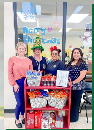
Snack Cart for Teachers