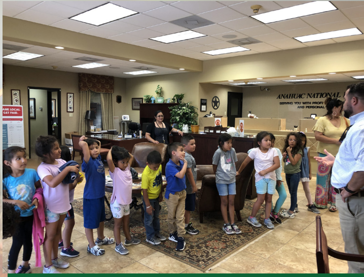
ESL Class field trip to ANB to learn about money, accounts and enjoy ice cream!