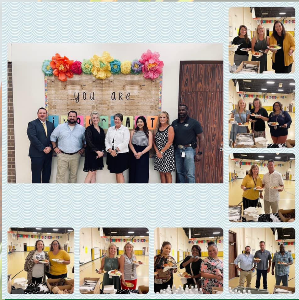
Anahuac ISD Teacher luncheon