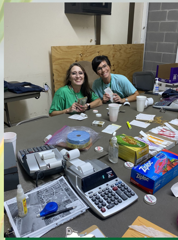
Bankers counting money behind the scene at Gatorfest