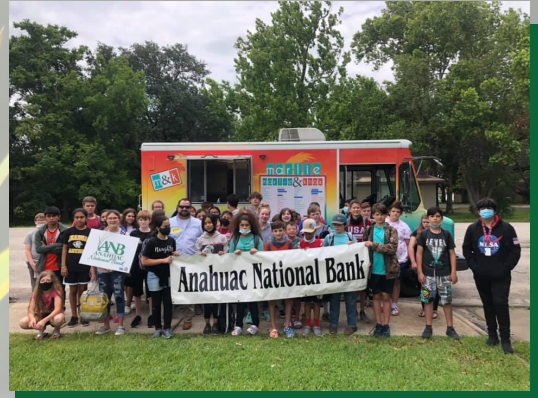
Snow Cone Day for middle school students completing 40 book challenge