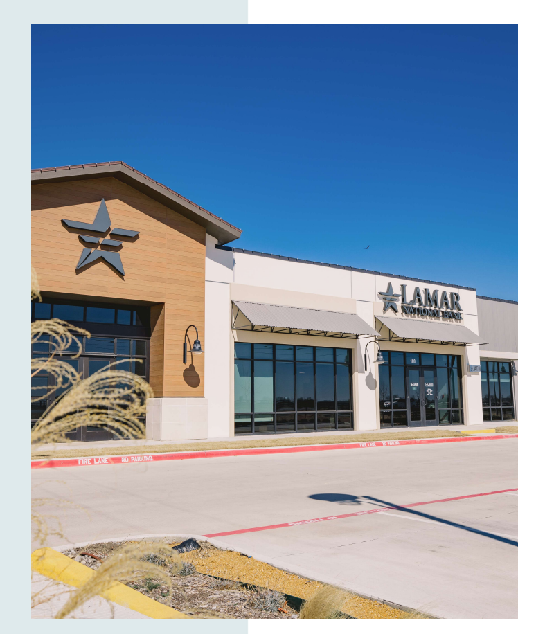
2022 Best of Community Banking Entry- Architectural Design